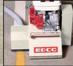
Edger Assembly Part # 65027 / Edger Drum Part # C66040